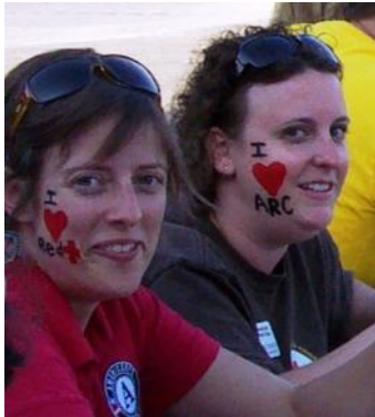
Sheriff's Fish Fry