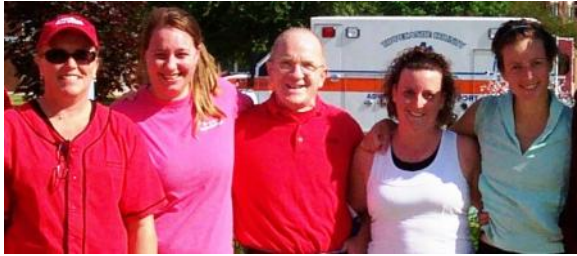
Run for the RED