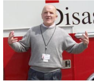
Disaster Vehicle Life