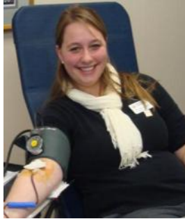
Battle of the Badges